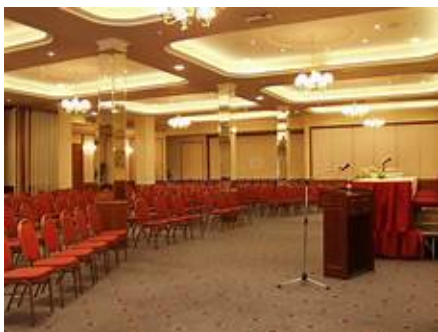
Covid-19 symptom- A lot of empty rooms

To say the Corona virus has been life altering, is a huge understatement. It has affected not just authors, or Floridians, or Americans, it's effected about every human on earth in some manner. The fabric of our daily lives changed, forcibly. Finding and accepting new norms has been difficult and painful. One has to ask the question when, if ever, will our lives return to "normal." The virus was aided by the racial tension stoked by election year politics. It hasn't been a good year for any of us. Making lemonade out of the lemons dropped on us hasn't been easy. Still there are a few things. One is the rediscovery of reading. I think the uptake has had two major boosters. The first obvious one is that confinement to quarters sends people looking for something to do. Reading is there to oblige. The second is the deplorable offerings available on TV and its allied products. People are sick of 'news' that isn't, agenda filled shows that prescribe how we should think and live and screaming idiots from both sides of the aisle we'd love to see as disposables in a 'Jaws' movie. Many folks I've talked to say, reading rescued them, and is so much more pleasant than munching the manure the